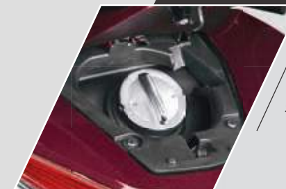
DOUBLE LID EXTERNAL FUEL FILL

One compact console ensures safety of the vehicle and convenience of opening underseat storage & external fuel lid.