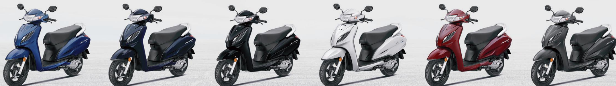
Decent Blue Metallic