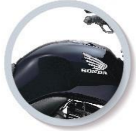
Pearl Siren Blue