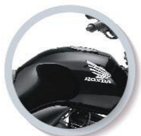
Pearl Igneous Black